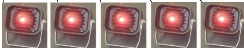
Microphon Station 1